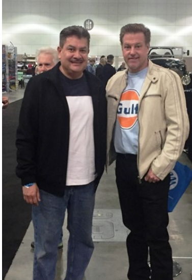
With Chip Foose