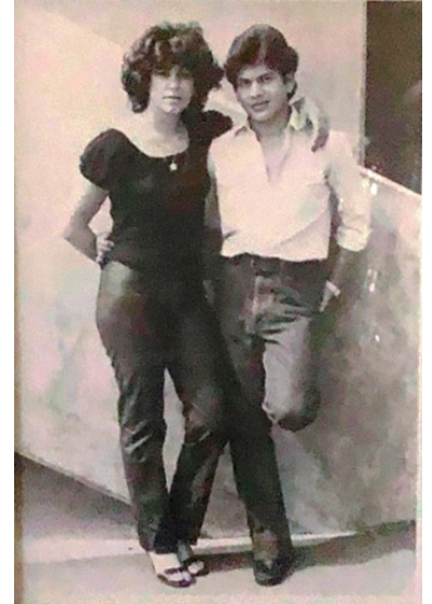
"High School Days"