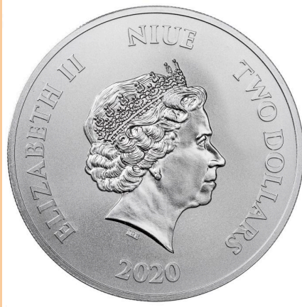
Left: Niue Merry Christmas Santa Claus Ultra High Relief 1 oz Silver $2 Coin