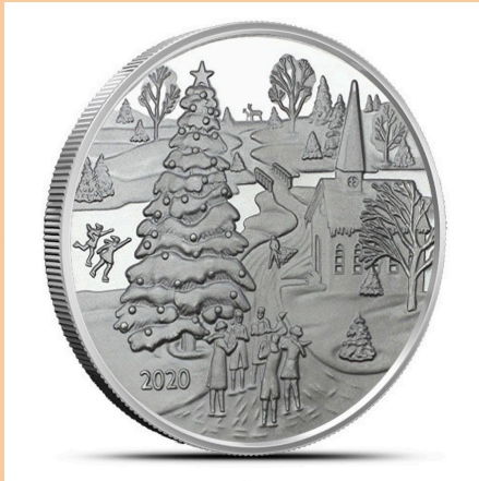
Left/Right: Christmas Village Silver Round 1 oz