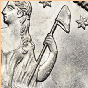
Liberty Cap Liberty/freedom; Cap given to freed Roman slaves

Our early and modern coins are full of symbolism. Many symbols have ancient Greek and Roman origins and were widely used in the 18th and 19th centuries