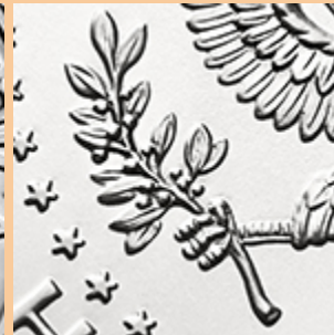
Olive Branch Peace