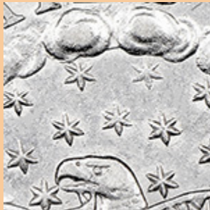
Stars States; Stars and Clouds Together symbolize America as a new nation