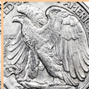
Bald Eagle National Bird