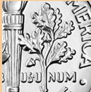
Oak Branch Strength and Independence