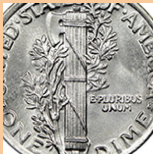
Fasces Strength through Unity; Roman Symbol of wood Rods tied around an ax