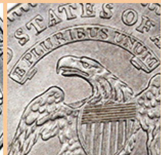
E Pluribus Unum National Motto: Latin for, "Out of Many, One"