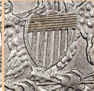
Union Shield From the Great Seal; Represents Congress and the original 13 colonies