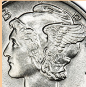
Cap with Wings Freedom of Thought