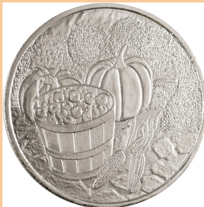
Left: 1 oz Silver Round - Thanksgiving