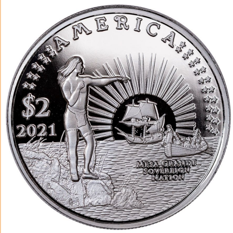
Left/Right: Mesa Grande First Thanksgiving 1 oz Silver Colorized Proof