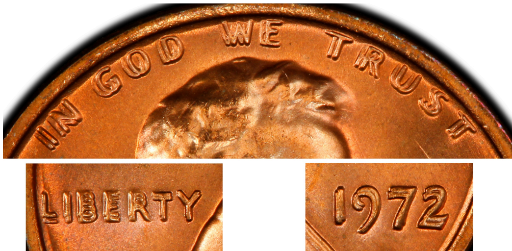
1972 Doubled Die Obverse

aThe 1960-D curiously features a date that appears to have the same date struck over it, only with smaller numerals, giving it added three-dimensional depth in its appearance. The 1966 exhibits noticeable doubling on "ONE CENT," the designer's initials, and "UNITED STATES OF AMERICA." The 1972 issue is known to have 10 different doubled die obverses, some more dramatic and rarer than others. (And I would be remiss not to mention the exceptionally rare and valuable 1969-S and 1970-S Doubled Die Obverse.)