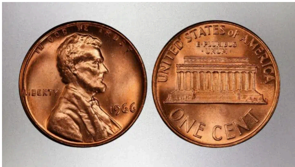
1966 Doubled Die Reverse