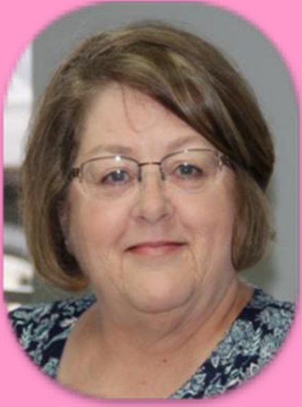
2 nd Vice President, Membership