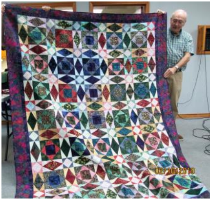
2001 class in Alaska "Storm at Sea"