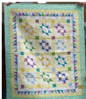
"Brylie's Star" (all HST)