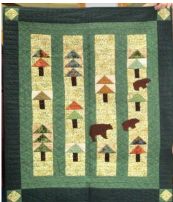
"Bear in the Woods"