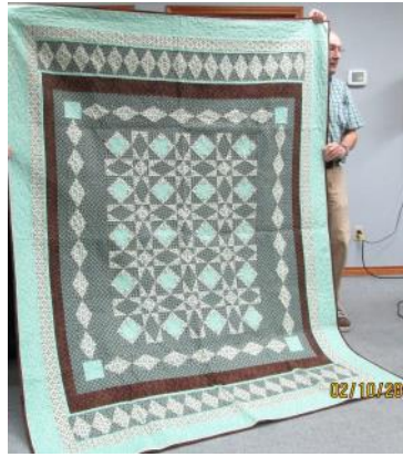
Lisa's "Storm at Sea"