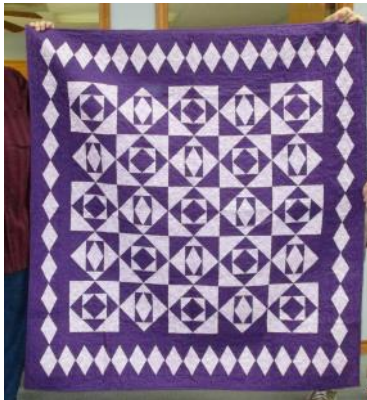
"Hidden Star "