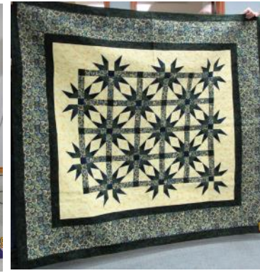
"Trinity River Bridge"