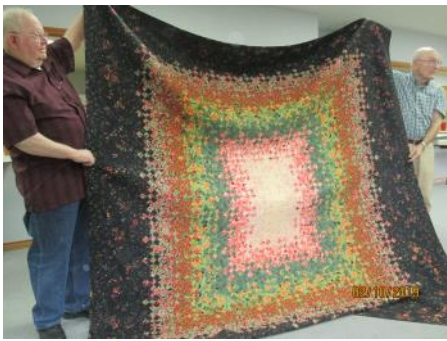
"Blooming 9 patch"