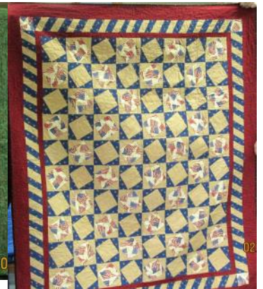
"Lickety Split" wonky cut