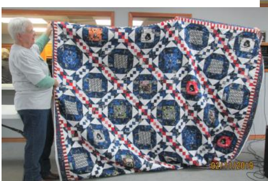
Bitsy made this Star Wars QoV and on back was Sarah's postage stamp quilt