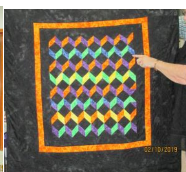
"In the Garden" w/tumbling block