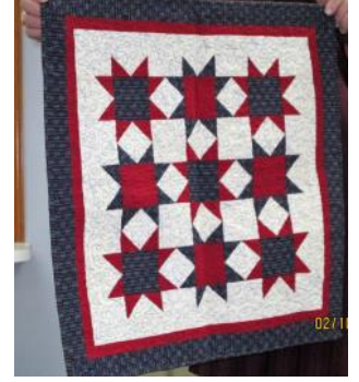
made in teacher class