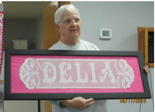
Made by filet crochet technique