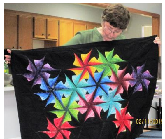
Bobbie's "Twisted Log Cabin"