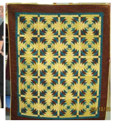
Pineapple Square in Square