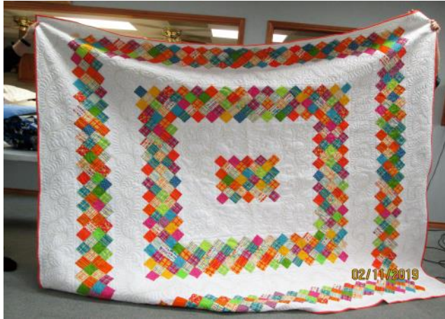
Glenda's "Tossed Salad"