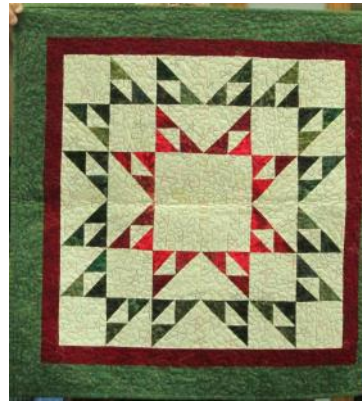
"Christmas Star" (Exploding Star)