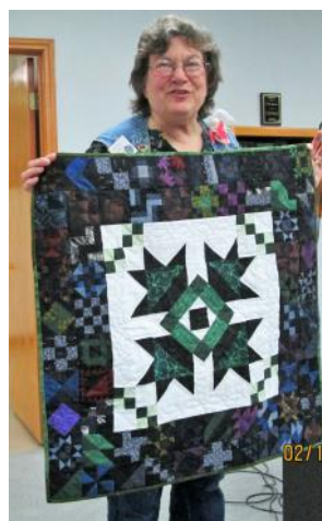
"Australian Quilt 2017"