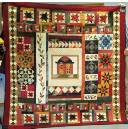
"Pony Express Sampler"