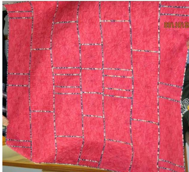
"Continuum" a Quilt as you go