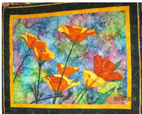
“Jean Ann’s Garden” embellished with seed beads