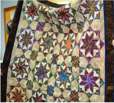
“Radiation Therapy” won 3rd place Edyta Sitar pattern “Eldon”