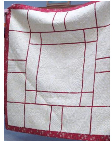
Oregon Trails pattern aka "Argumentative Hussy" because she demanded borders