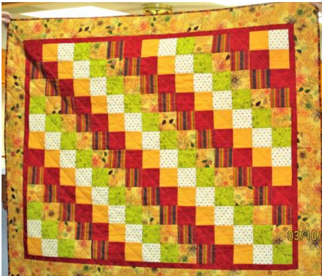
Ann's first quilt, stitched in the ditch