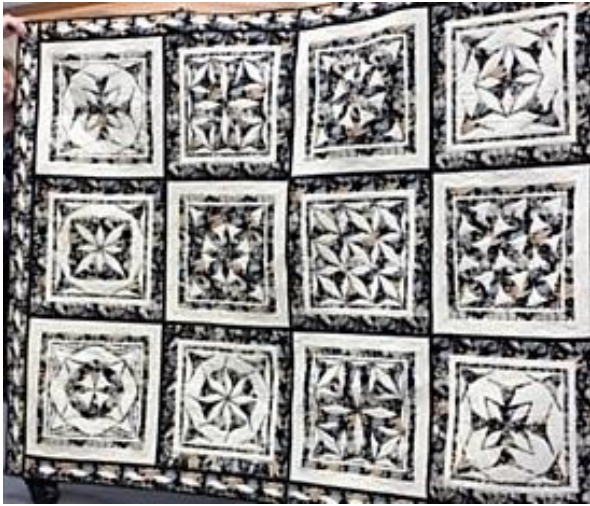
Westalee "flying bell curve triangle" template