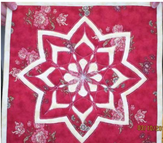
Cutwork using 2 sets of rulers