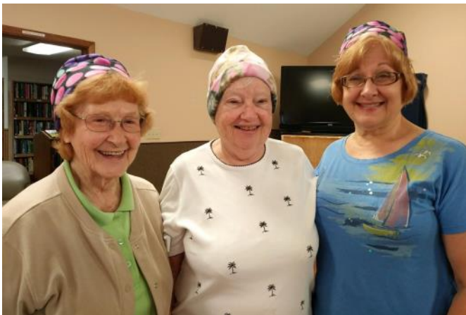
Some ladies at Escapees model hats they made at a Thursday Bee

Some tips as to what judges look for at shows: something out of the ordinary, colors that stand out, something unique. Make sure that points are pointed, no threads showing on back, binding is full and straight. When you are quilting: check tension every time you change bobbins, make sure your seams are straight, pin every 4" - 5" and start in the center. Ann uses colored safety pin covers, marks center vertically and horizontally, using one color for each direction. Then pin (using a different color) each quadrant and when you reach a different color while quilting, you need to change direction to complete the quadrant. Ann does not wash her quilts but blocks them by: laying out on carpet, use long pins every 2", use long ruler to check sides and stretch it to be straight. She uses a ConAir steamer and saturates quilt then turns the fan on to dry it. She does this again multiple times.