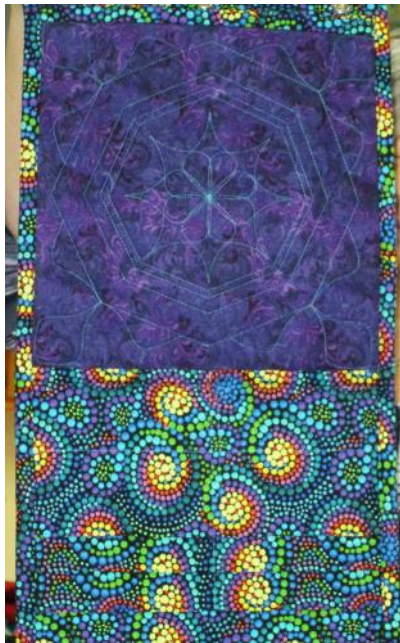
Case for Janome ruler set