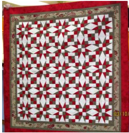
“Sometimes Done is Better than Perfect”