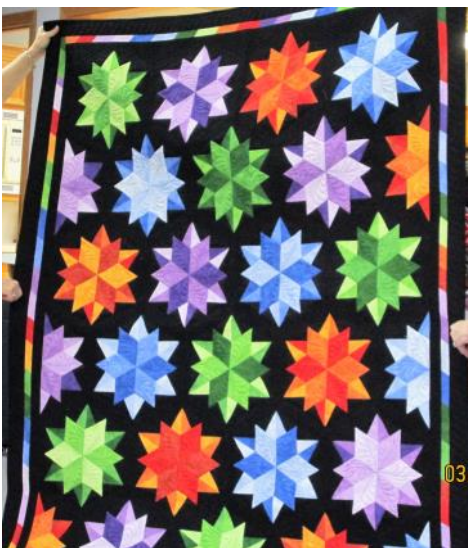
“Big Sky” 1st place Ann advises to stitch over “ESS” Every Stinking Seam!