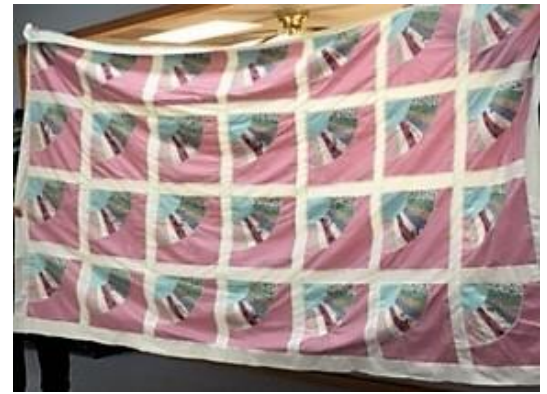
Ann's grandmother began quilting after Ann was grown. This quilt top from 30 years ago will be quilted by Ann

Some tips as to what judges look for at shows: something out of the ordinary, colors that stand out, something unique. Make sure that points are pointed, no threads showing on back, binding is full and straight. When you are quilting: check tension every time you change bobbins, make sure your seams are straight, pin every 4" - 5" and start in the center. Ann uses colored safety pin covers, marks center vertically and horizontally, using one color for each direction. Then pin (using a different color) each quadrant and when you reach a different color while quilting, you need to change direction to complete the quadrant. Ann does not wash her quilts but blocks them by: laying out on carpet, use long pins every 2", use long ruler to check sides and stretch it to be straight. She uses a ConAir steamer and saturates quilt then turns the fan on to dry it. She does this again multiple times.