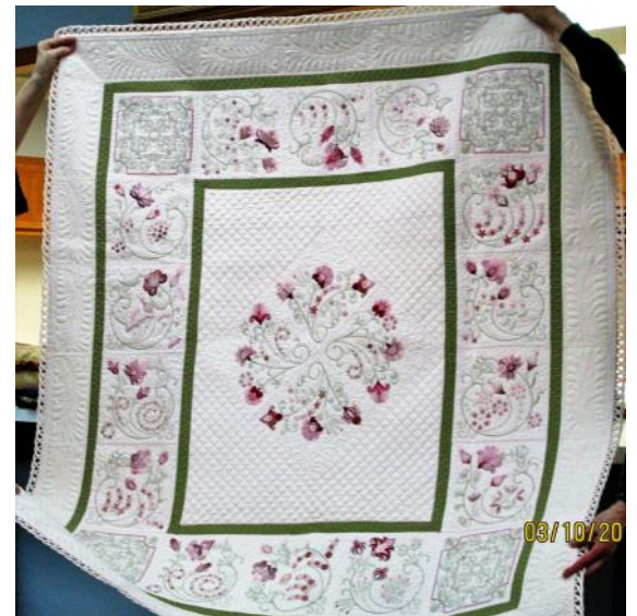
“Springtime Bouquet” with corded binding took 1sts in Conroe and Walker Co. Fair and 2nd in Dallas