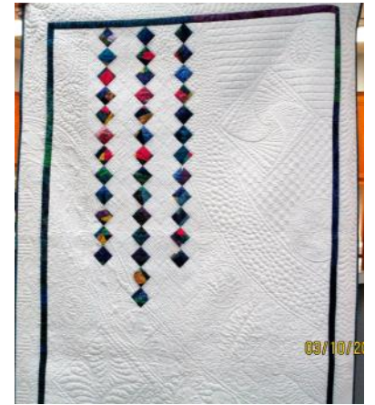
“Diamonds and Pearls” to showcase skills learned in Cindy’s class 2nd place