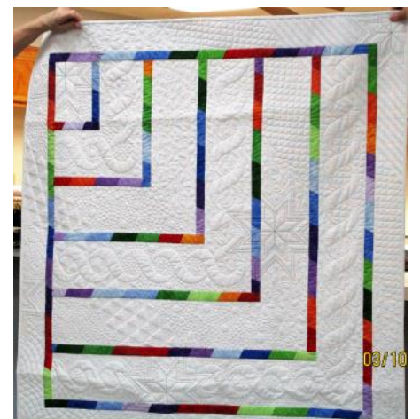
“Rainbow Leftovers” using binding scraps left over from Big Sky