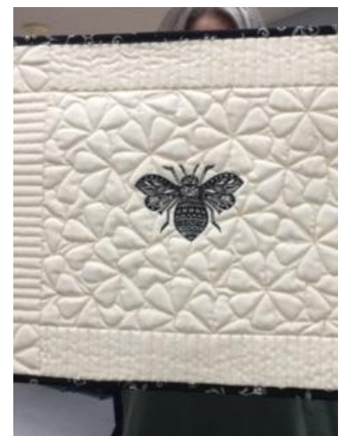
Janome design built in to embroidery machine