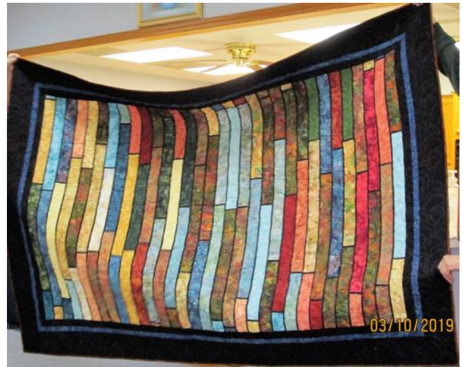
Jelly roll quilt—the addition of black adds another dimension, gives a "stained glass" effect