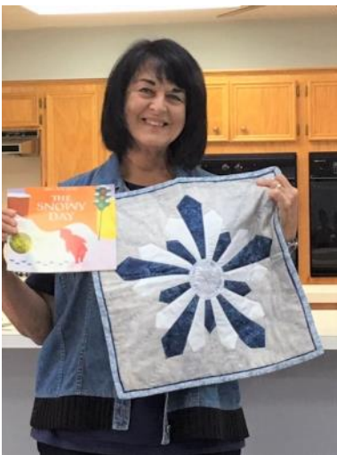
Brenda made a Dresden snow flake to go with "The Snowy Day"