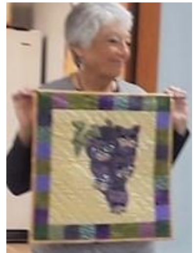
Sue's cat wall hanging