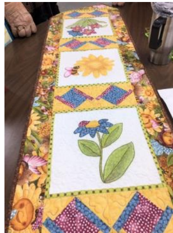
Sunflower table runner, traced from background fabric and enlarged