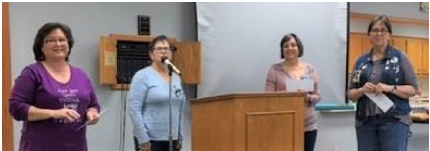
Prizes were awarded for the September Challenge, "Won't You Be My Neighbor".