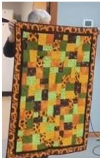
Sue showed "Twisty Road to Ellens"