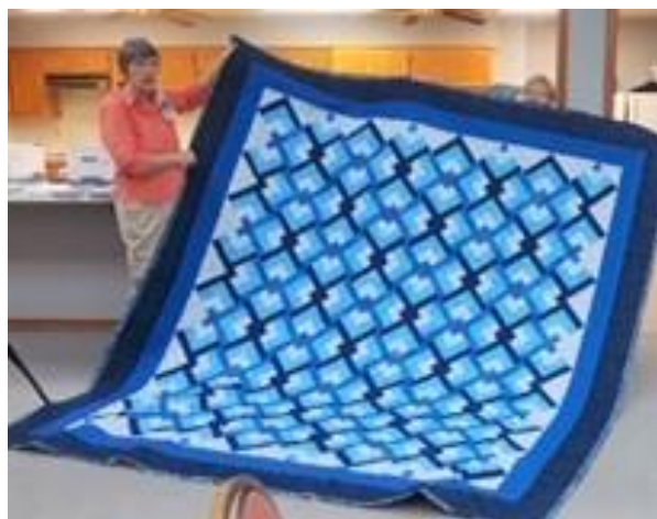
Lauren brought "Log Cabin Blue" quilt