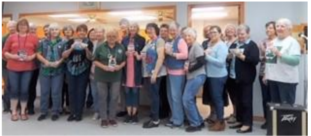
Bitsy Barr presented Angels to all who have completed a Quilt of Valor since our last presentation in November 2017. There are too many to name. Thanks to each and every one — you ARE angels!