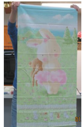
Bunny in tutu