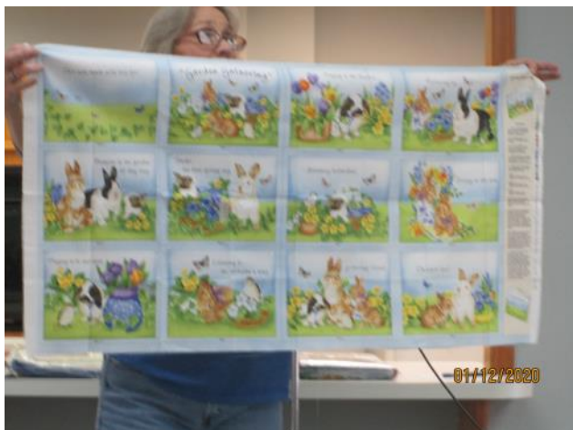
Bunny book used in "Garden Gathering" page 8

Digitized printed panels allows for an unlimited number of colors to be used