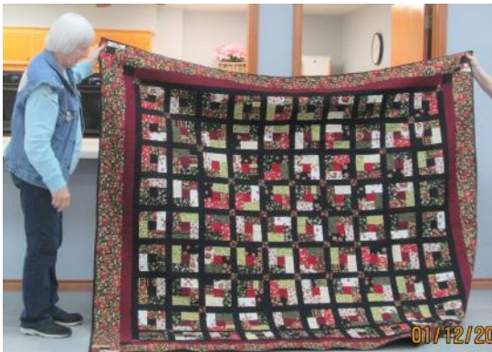
Sally made this using a jelly roll plus 3 fabrics