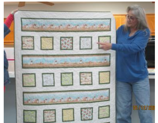
Using border stripes