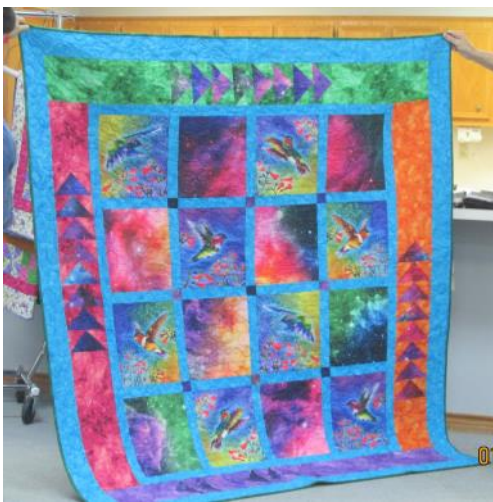
Free pattern made with Kaufman birds and Northcott gradations