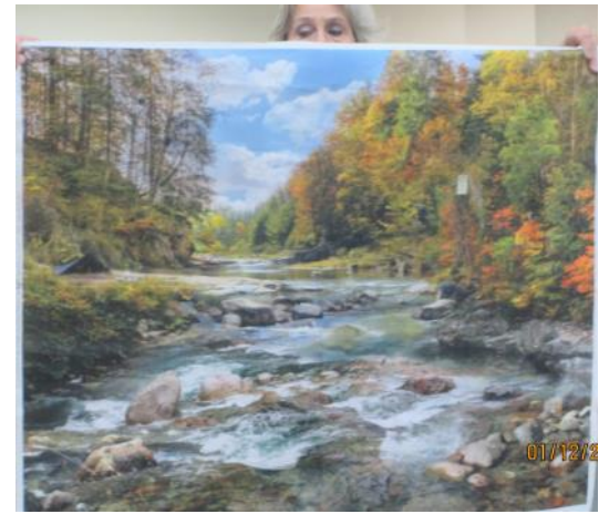
Call of the wild river (Hoffman fabric)