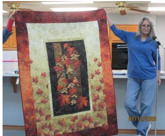
Maplewood panel on ombre fabric