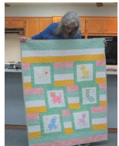
Baby animals—Harmony pattern