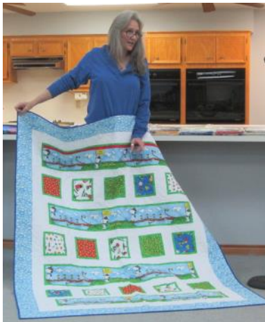
Snoopy border stripes