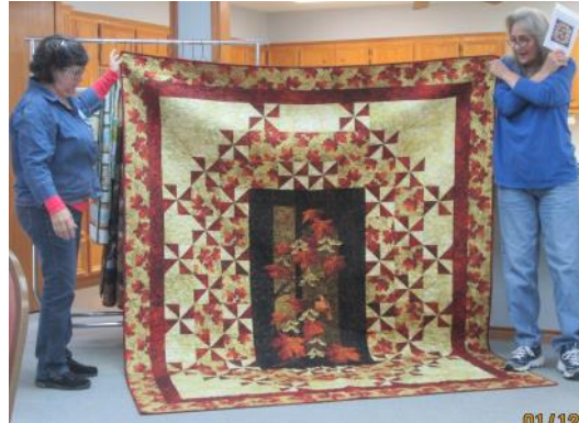
Grand Central from Northcutt Stonehenge collection