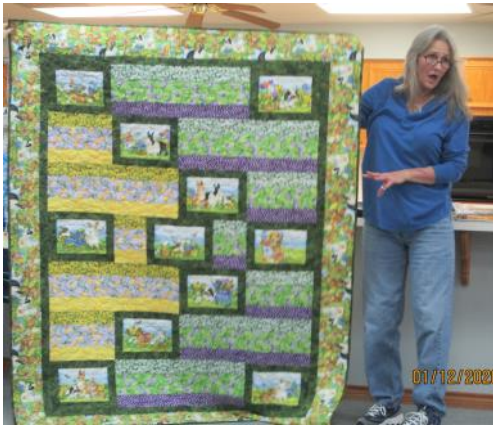
Garden Gathering— Harmony pattern