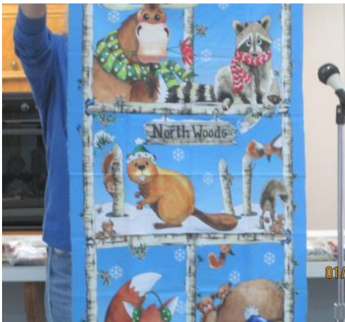
QT fabrics "Northern Friends"