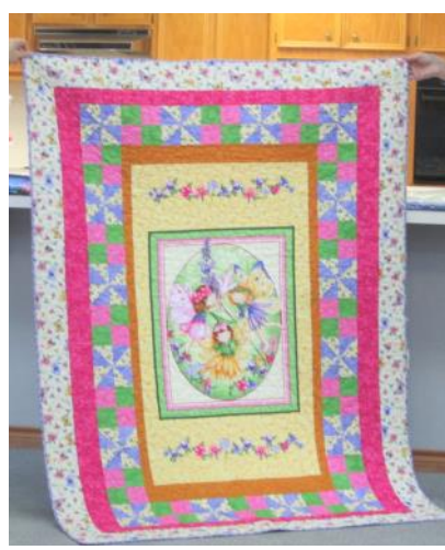
Fairy quilt made with panel