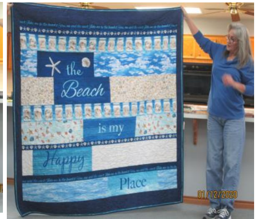
The Beach is my Happy Place panel cut apart