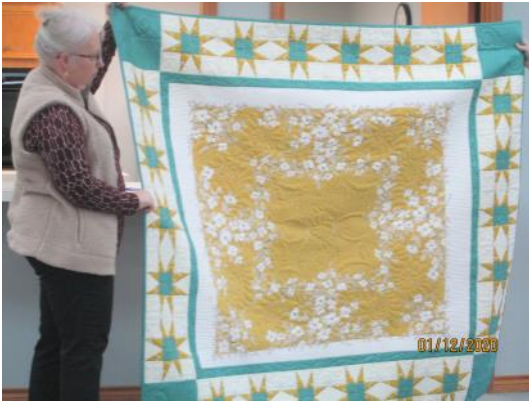
Jammie shows a $5 tablecloth turned into a quilt