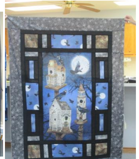
panel used with "Cubby Holes" pattern

Donnette can be reached at storytimequilting.com and on EBay as storytimequilts