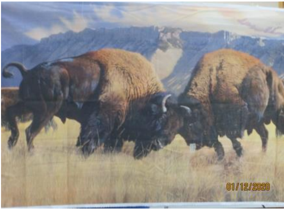
Riley Blake panels "push come to shove"