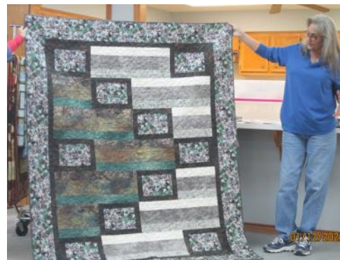
Actual Harmony pattern as printed