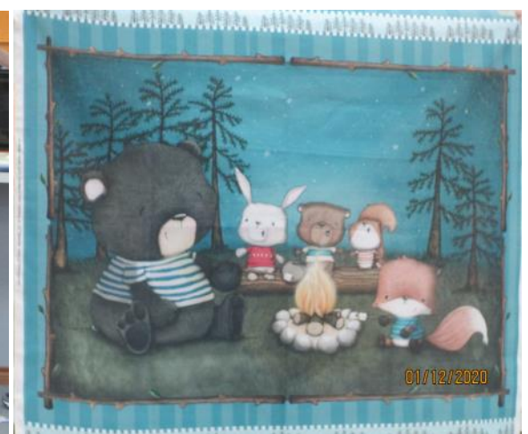
Camping friends by QT