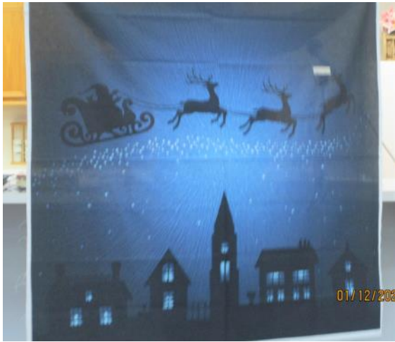
Christmas silhouette panel