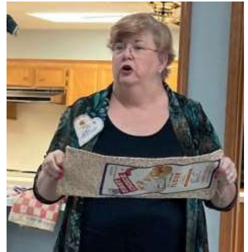
Flour sacks came with a pasted on label which could be soaked off