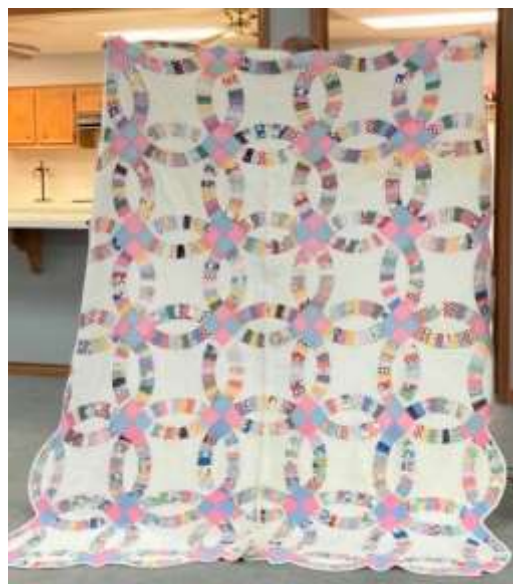
double wedding ring, hand-pieced but machine quilted