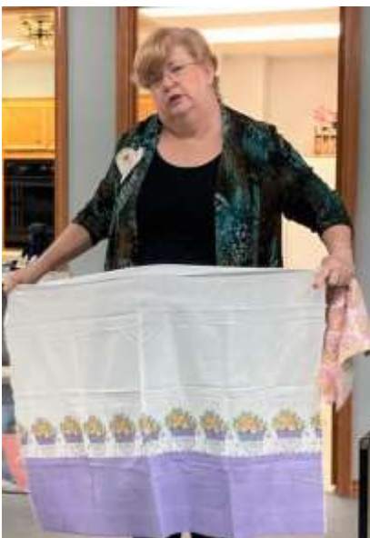
Feed sacks were used not only for clothing, but border prints were used for home decorating