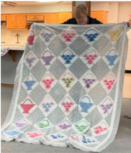
Basket quilt all hand-pieced and hand-quilted