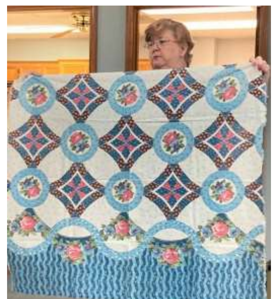
One of the first “cheater cloths” and also a border print