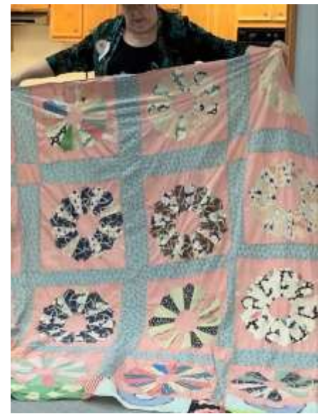
circle quilt probably from early 1900s