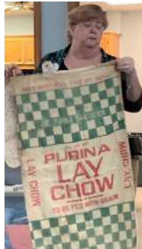
Feed sacks were larger, but a coarser woven fabric