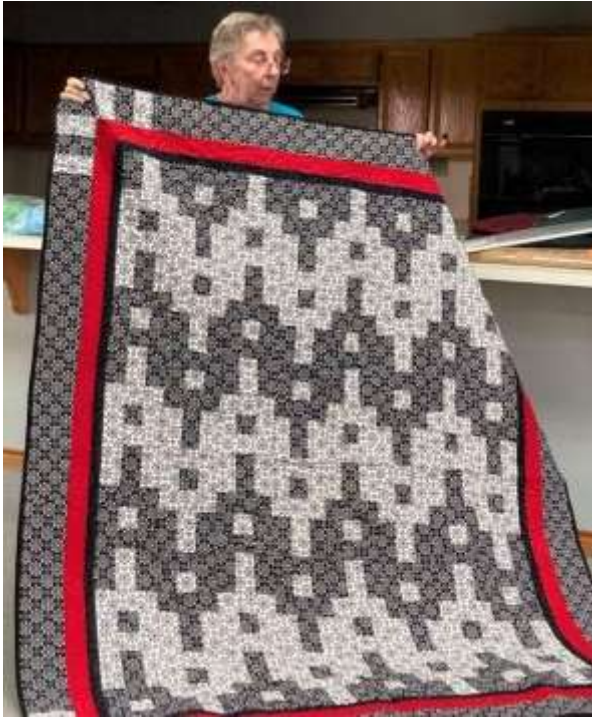
Sandra C brought “Black and White”