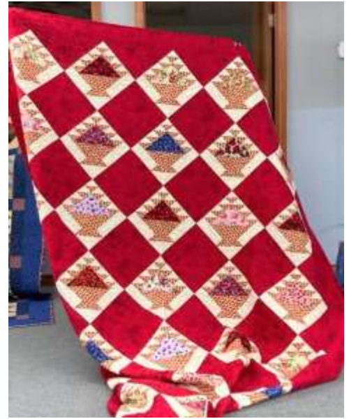
Karen Lee’s Basket block