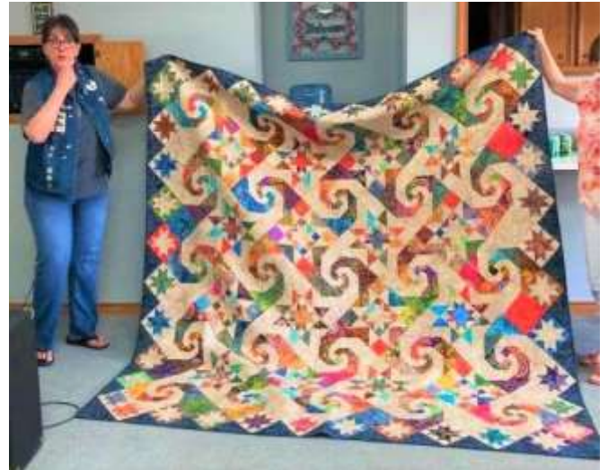
"Shakespeare In the Park" which won 2nd place award for piecing at 2012 Guild Show