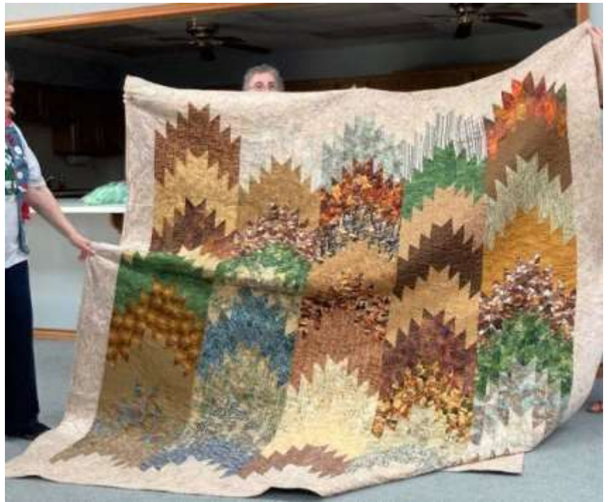
Sandra C called this one “Done!”