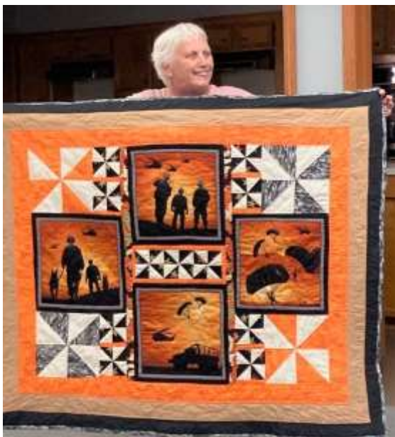
LyLa has another QoV ready to go