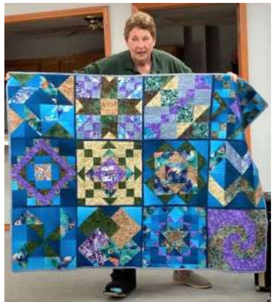
Sondra did an internet sew-along, a block a week. Finished as "quilt as you go" and was inspired by Barb Edmondson to use embroidery machine to quilt it