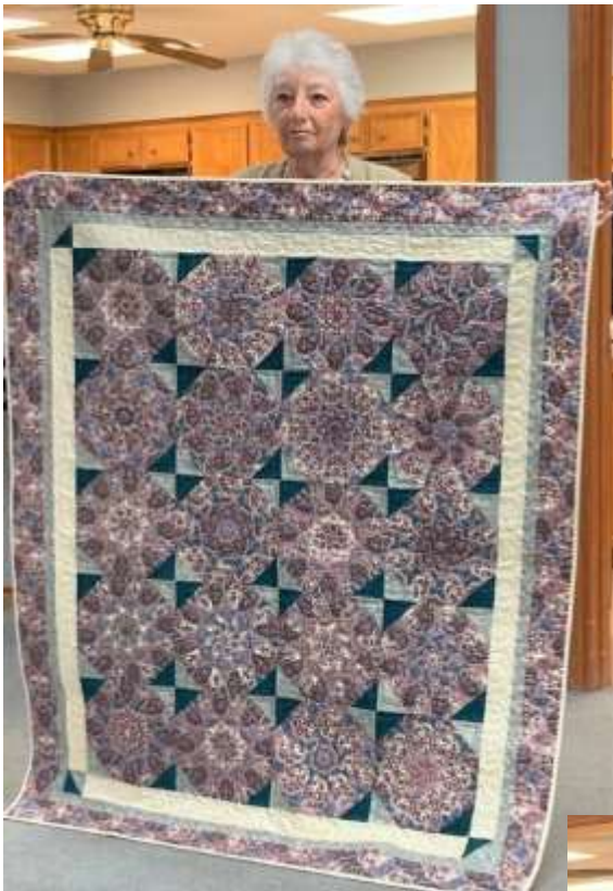
Sue completed her Stack ‘n Whack