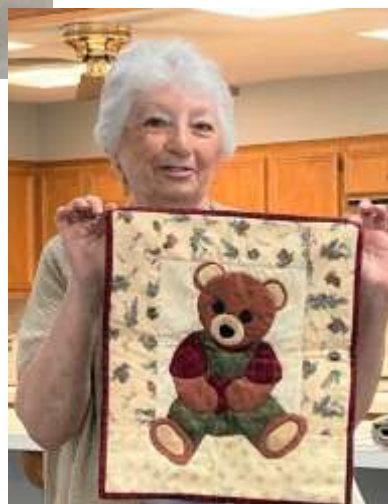
All flannel hand applique