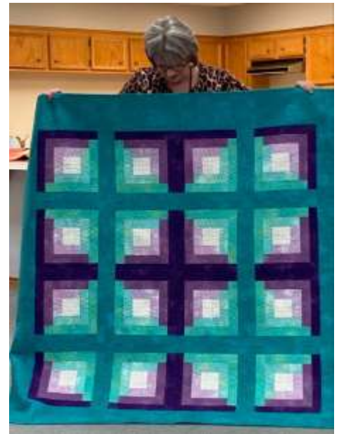
Turquoise and purple make up this “double wedding ring log cabin”