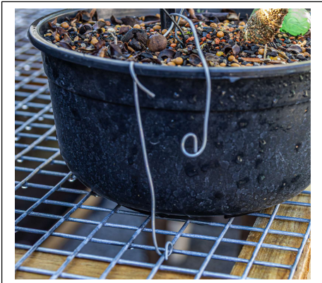
Wiring down the pots with Reo wire.