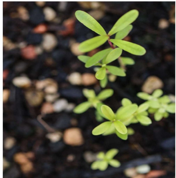
Lemon scented Tea Tree seeds