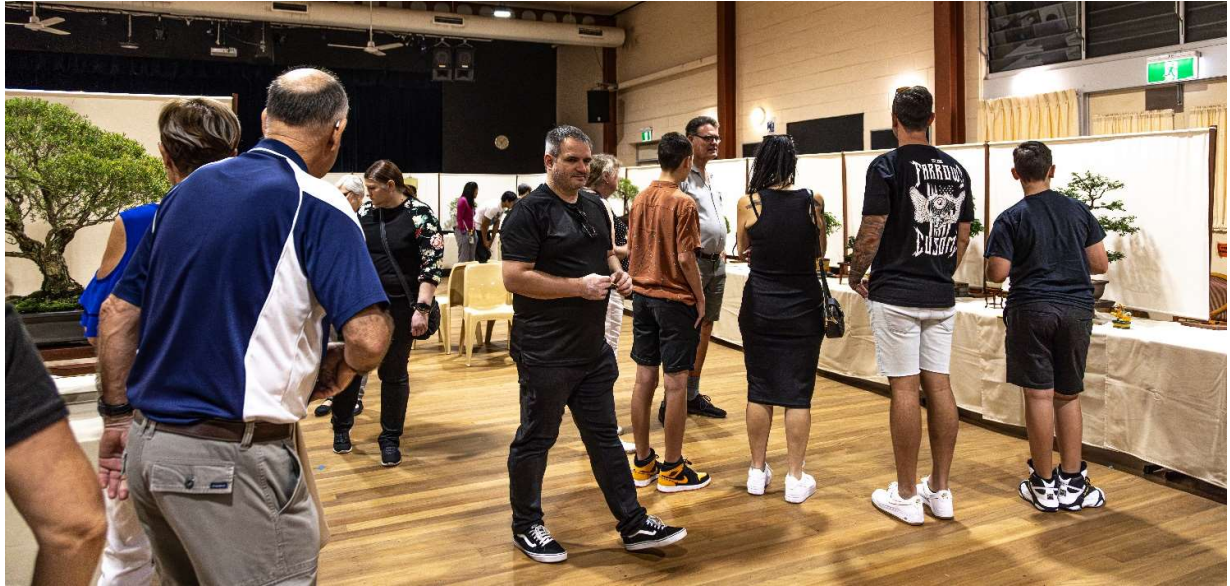
One of the trading tables