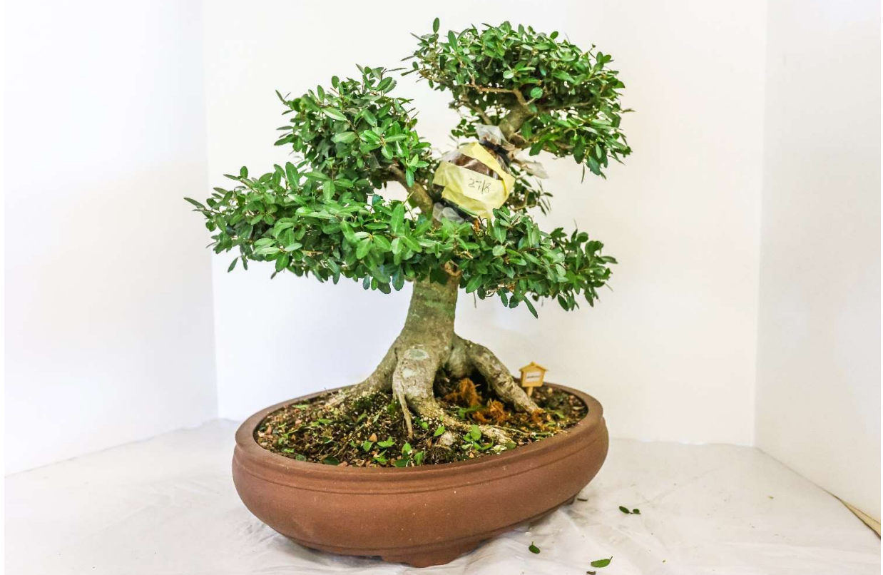
Visit us at: