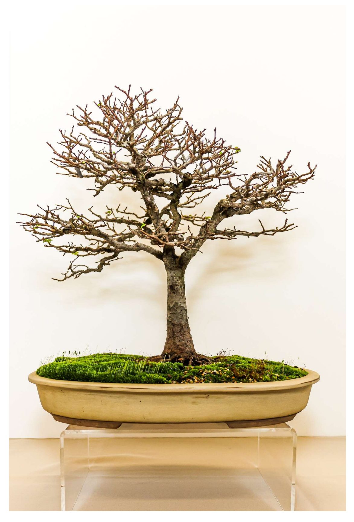
Visit us at: