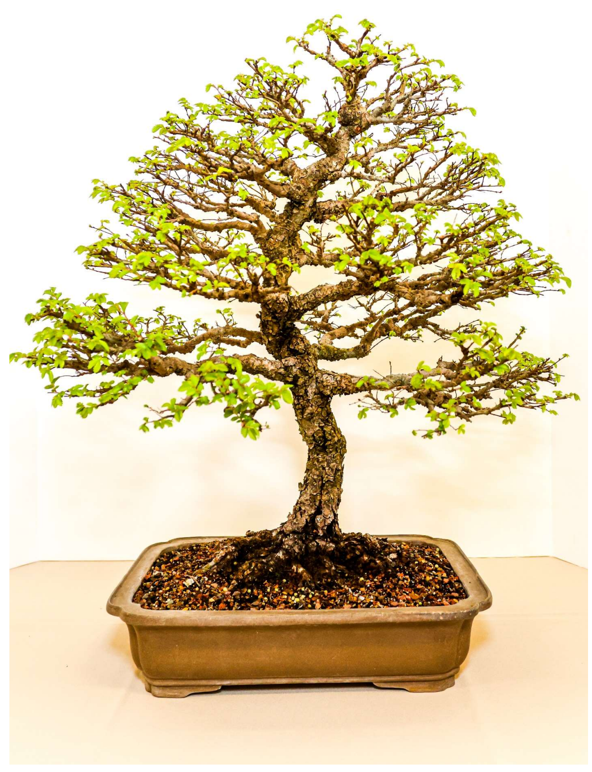
Visit us at: