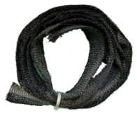
KAT SHIELD COLOR VARIES

STEP 3 – VEHICLES EITHER COME WITH THEIR CONVERTERS HELD IN PLACE BY A WELDED SYSTEM OR WITH EXHAUST CLAMPS.