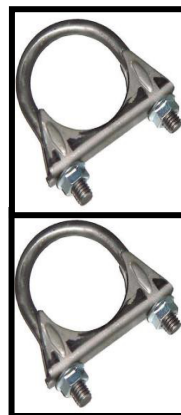
(REUSE EXHAUST CLAMPS BY OEM OR DISREGARD IF NO OEM CLAMPS)

KAT SHIELD TIGHT TO UNDERSIDE 3 STAINLESS STEEL TIE