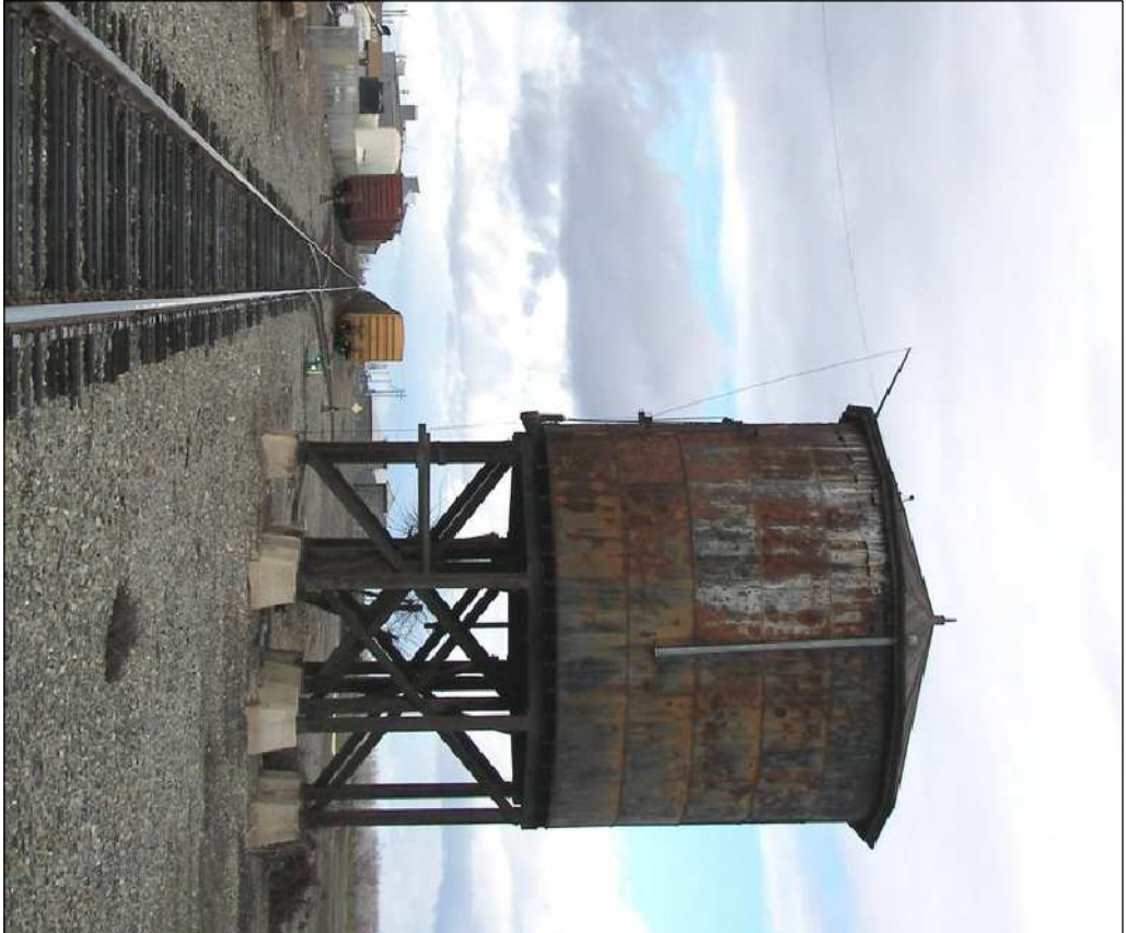
250 MILES FROM GILBERT SPRING TO SOUTH FLORIDA WITH A TOWER AND LEARNING CENTER EVERY 7-15 MILES

44TH PRESIDENT TOWER REPLICA OBAMA WATER TOWER FINAL OBAMA WATER TOWER IN FORT LAUDERDALE (REPLICA OF ORIGINAL CHICAGO WATER TOWER)