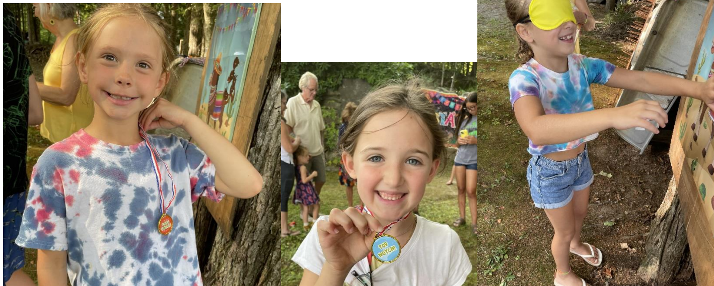
Pin the Tail on the Donkey -- with stickers instead of pins. Lots of award handed out!