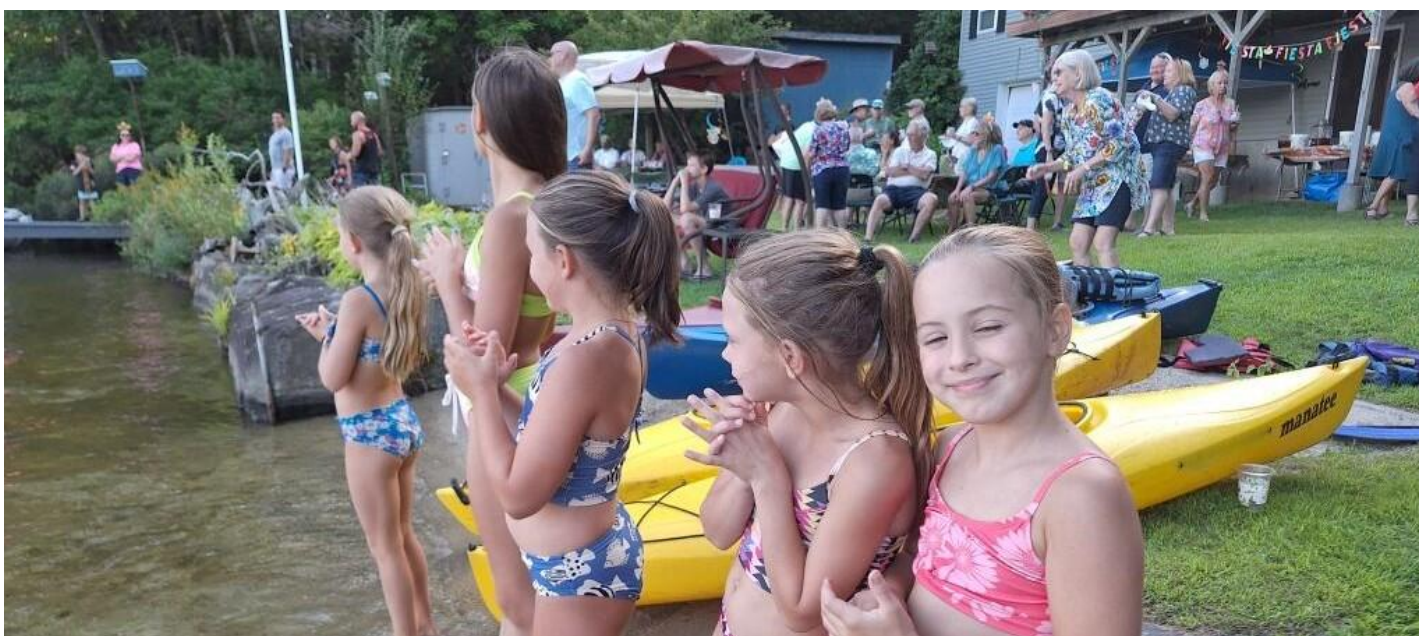
Everyone cheering on the swimmers – these kids are FAST!