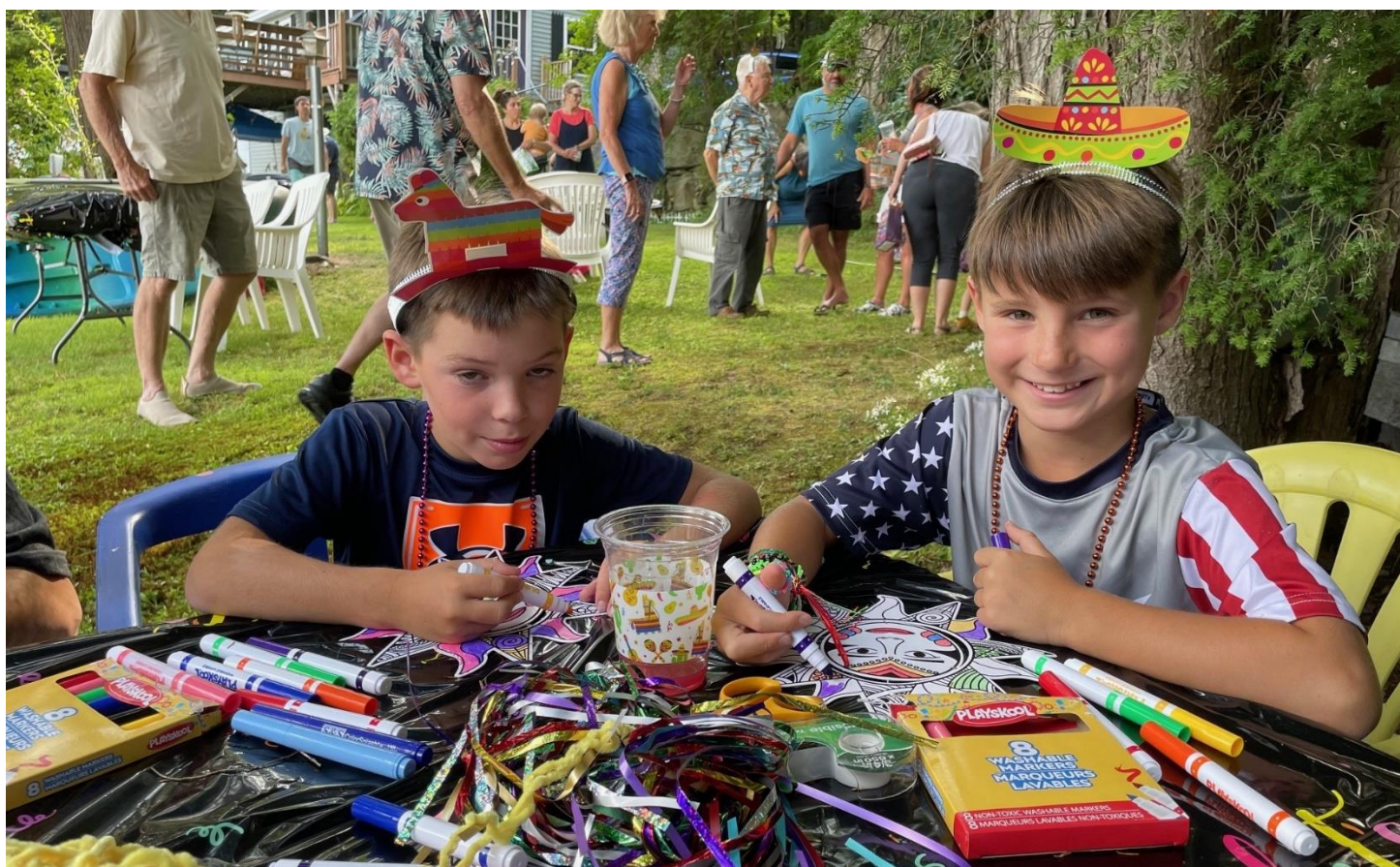
Lots of crafts – when kids weren't competing in other events!