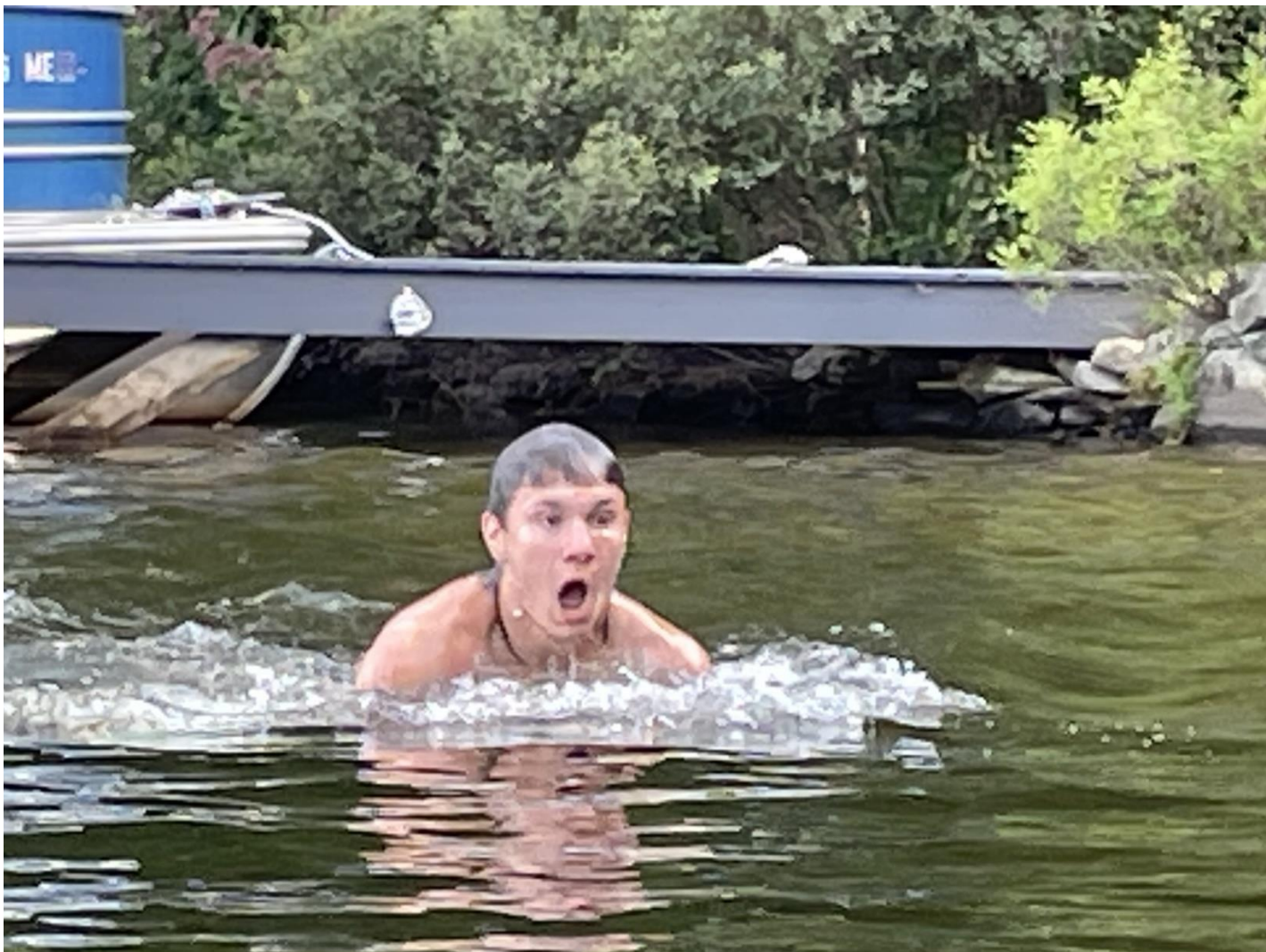
Different age groups competed in timed swimming events