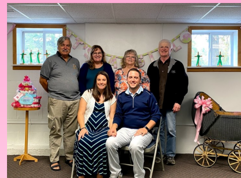
Grandpas and Grandmas