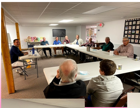
The guys were exchanging stories on how to raise children!!!