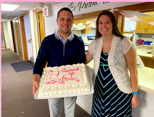
Dad and Mom