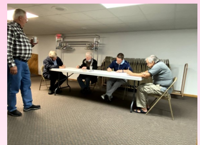
The Grandpas and Dad had to draw a dollhouse. After they drew the house, they had to build it with a deck of cards!!!!