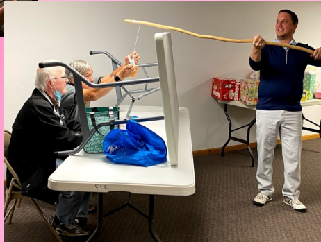
Of course the guys had to play a fishing game!!!