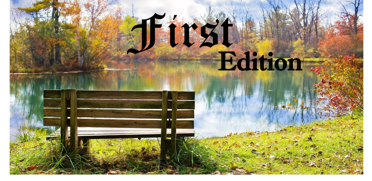
MONTHLY NEWSLETTER OF FIRST LUTHERAN SEPTEMBER 2020

With summer coming to an end, I am still amazed at how fast it went by even though we were all cooped up in our houses the whole time. We could only travel to places when we had to for essential materials and that was about it. Many of the activities we would be doing during the summer either got delayed or cancelled. At least they did for me, anyways.