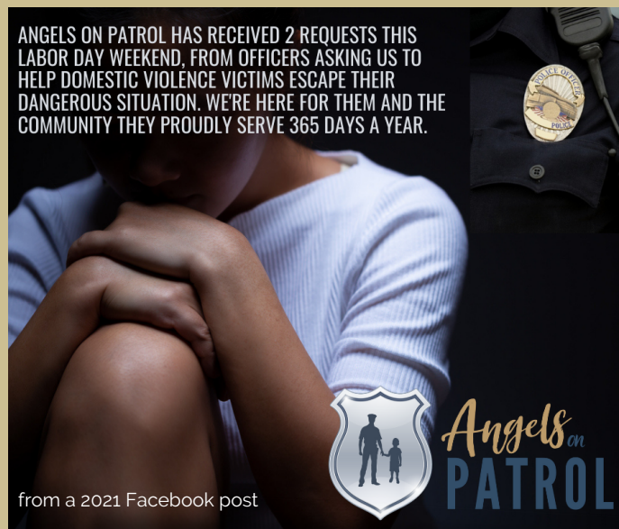
from a 2021 Facebook post

ANGELS ON PATROL HAS RECEIVED 2 REQUESTS THIS LABOR DAY WEEKEND, FROM OFFICERS ASKING US TO HELP DOMESTIC VIOLENCE VICTIMS ESCAPE THEIR DANGEROUS SITUATION. WE'RE HERE FOR THEM AND THE COMMUNITY THEY PROUDLY SERVE 365 DAYS A YEAR.