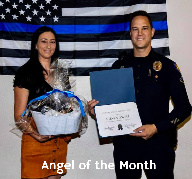
Angel of the Month