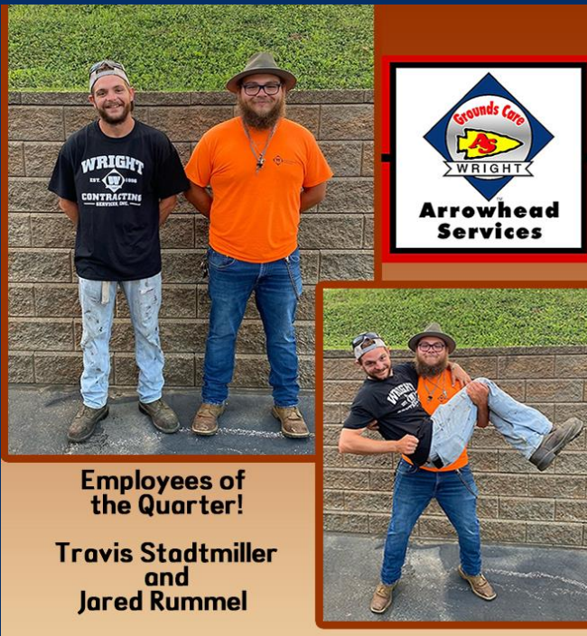
Employees of the Quarter!