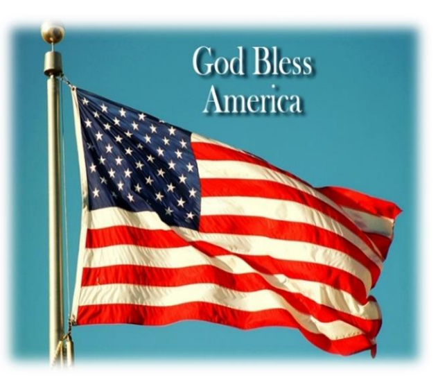
Pray for our Country