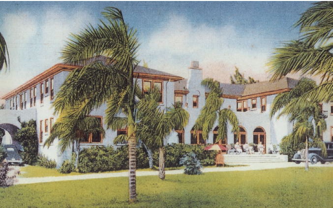
SHANGRI-LA SPRINGS WAS ESTABLISHED IN 1921