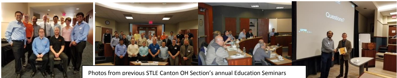
Photos from previous STLE Canton OH Section's annual Education Seminars