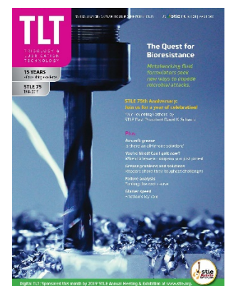
Digital TLT: Sponsored this month by Acme Surface at www.acme.com .