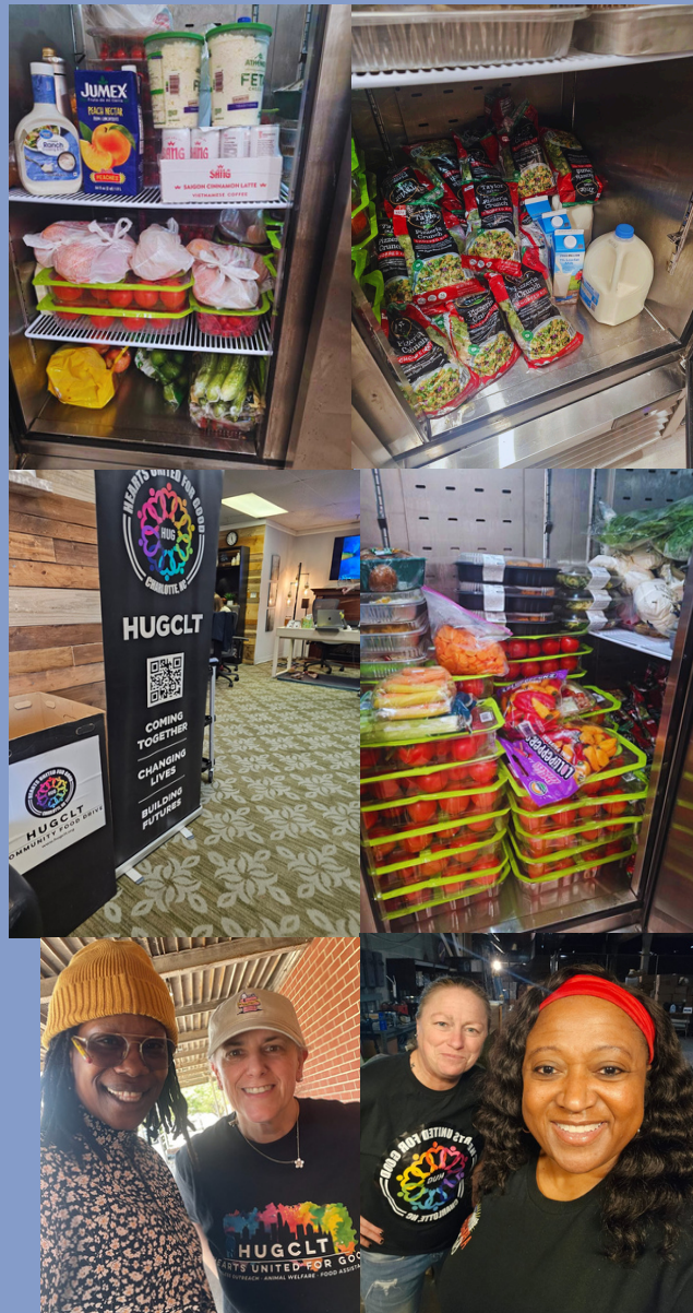
Food Pantry Donation QR Code