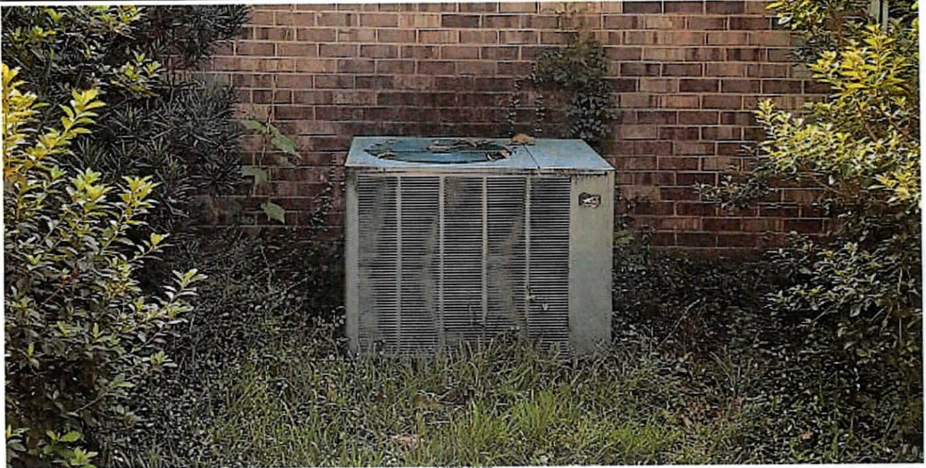
Photo Three Caption AC Unit

If submitting more photographs than will fit on the preceding page, affix the additional photographs below. Identify all photographs with: date taken; "Front View" and "Rear View"; and, if required, "Right Side View" and "Left Side View." When applicable, photographs must show the foundation with representative examples of the flood openings or vents, as indicated in Section A8.