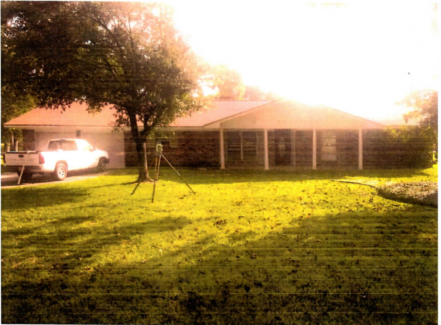
FRONT VIEW OF RESIDENCE

If using the Elevation Certificate to obtain NFIP flood insurance, affix at least 2 building photographs below according to the instructions for Item A6. Identify all photographs with date taken; "Front View" and "Rear View"; and, if required, "Right Side View" and "Left Side View." When applicable, photographs must show the foundation with representative examples of the flood openings or vents, as indicated in Section A8. If submitting more photographs than will fit on this page, use the Continuation Page.