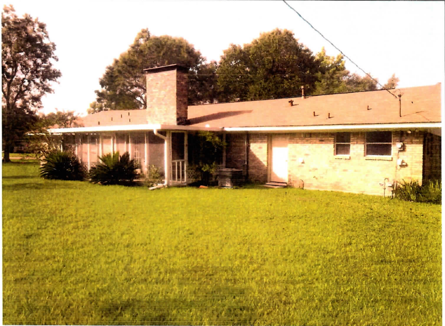
REAR VIEW OF RESIDENCE

If submitting more photographs than will fit on the preceding page, affix the additional photographs below. Identify all photographs with: date taken; "Front View" and "Rear View"; and, if required, "Right Side View" and "Left Side View." When applicable, photographs must show the foundation with representative examples of the flood openings or vents, as indicated in Section A8.