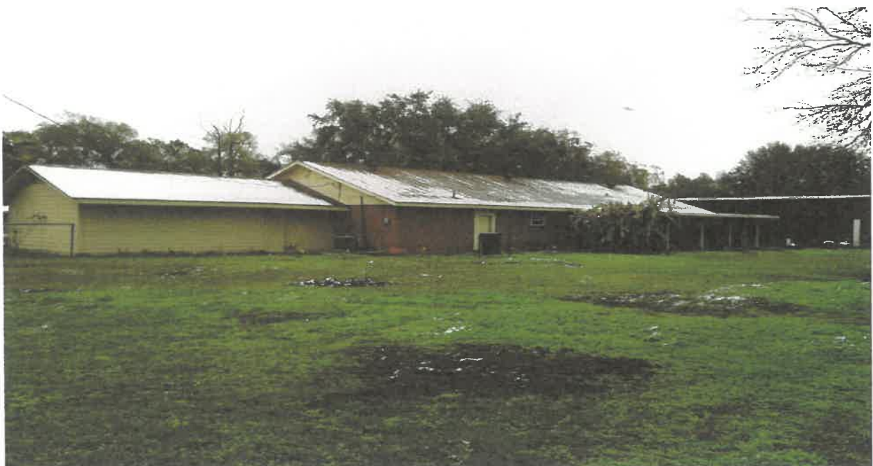
Photo Two Caption Rear View