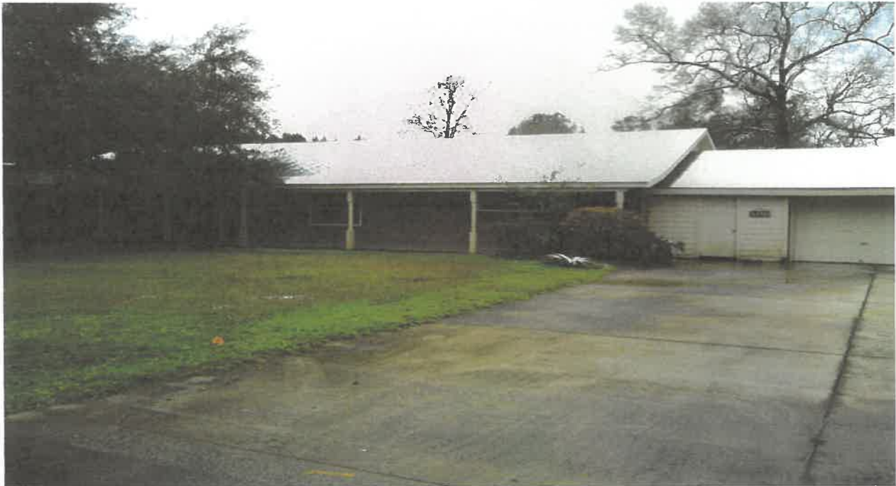
Photo One Caption Front View

If using the Elevation Certificate to obtain NFIP flood insurance, affix at least 2 building photographs below according to the instructions for Item A6. Identify all photographs with date taken; "Front View" and "Rear View"; and, if required, "Right Side View" and "Left Side View." When applicable, photographs must show the foundation with representative examples of the flood openings or vents, as indicated in Section A8. If submitting more photographs than will fit on this page, use the Continuation Page.