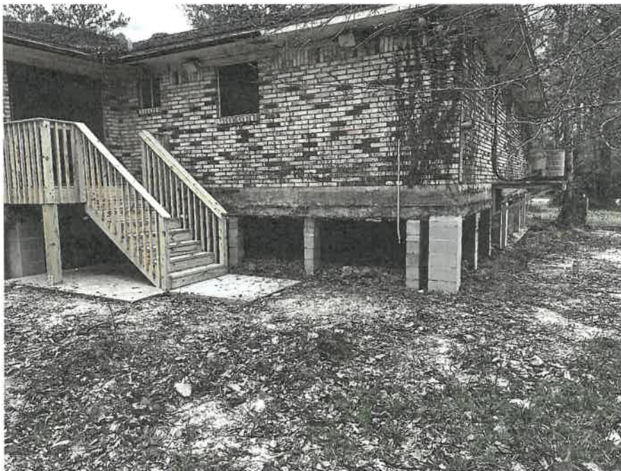
Photo Two Caption Back of Home 1-18-2022