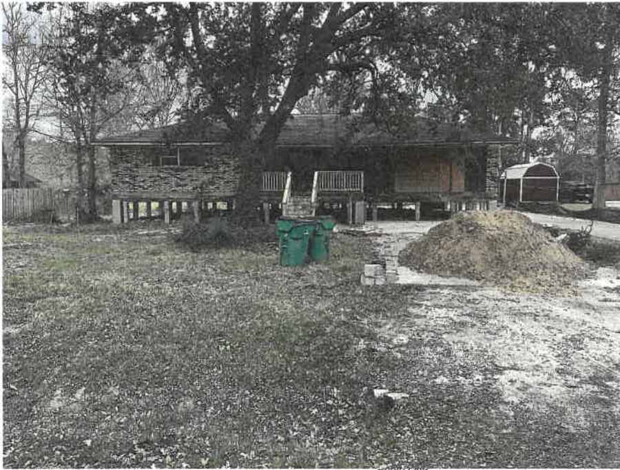
Photo One Caption Front of Home 1-18-2022

If using the Elevation Certificate to obtain NFIP flood insurance, affix at least 2 building photographs below according to the instructions for Item A6. Identify all photographs with date taken; "Front View" and "Rear View"; and, if required, "Right Side View" and "Left Side View." When applicable, photographs must show the foundation with representative examples of the flood openings or vents, as indicated in Section A8. If submitting more photographs than will fit on this page, use the Continuation Page.