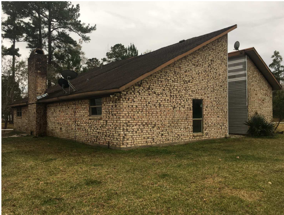
Photo Two Caption Rear View 12/13/2018