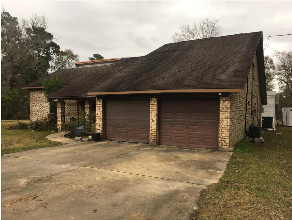
Photo One Caption Front View 12/13/2018

If using the Elevation Certificate to obtain NFIP flood insurance, affix at least 2 building photographs below according to the instructions for Item A6. Identify all photographs with date taken; "Front View" and "Rear View"; and, if required, "Right Side View" and "Left Side View." When applicable, photographs must show the foundation with representative examples of the flood openings or vents, as indicated in Section A8. If submitting more photographs than will fit on this page, use the Continuation Page.