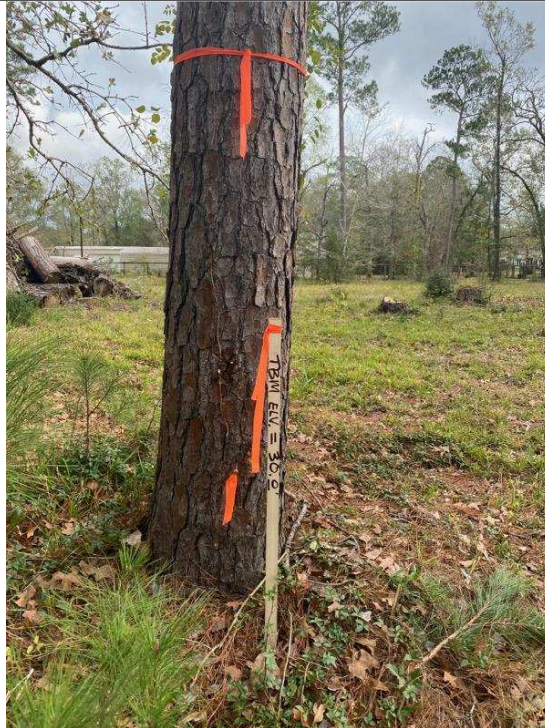
Photo One Caption TBM 12/13/2022

If using the Elevation Certificate to obtain NFIP flood insurance, affix at least 2 building photographs below according to the instructions for Item A6. Identify all photographs with date taken; "Front View" and "Rear View"; and, if required, "Right Side View" and "Left Side View." When applicable, photographs must show the foundation with representative examples of the flood openings or vents, as indicated in Section A8. If submitting more photographs than will fit on this page, use the Continuation Page.