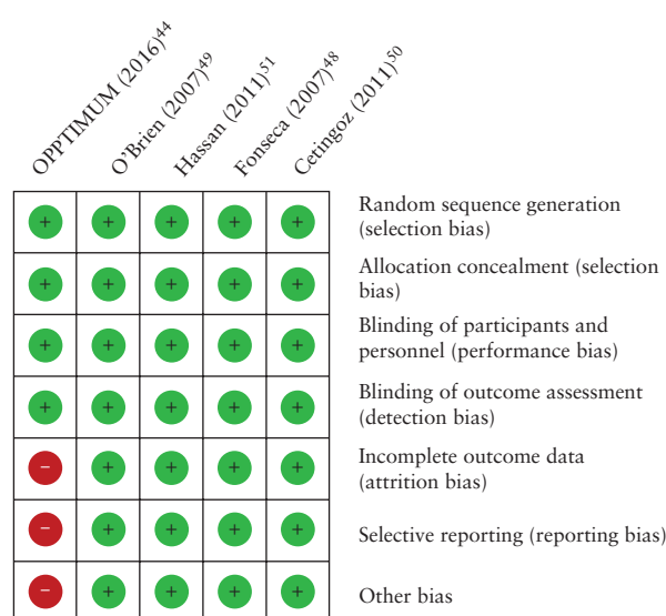
Figure 2 Risk of bias of studies included in the systematic review. Risk of bias: ●, low; ●, unclear; ●, high.

CL, cervical length; HIV, human immunodeficiency virus; PPRM, preterm prelabor rupture of the membranes; PTB, preterm birth.