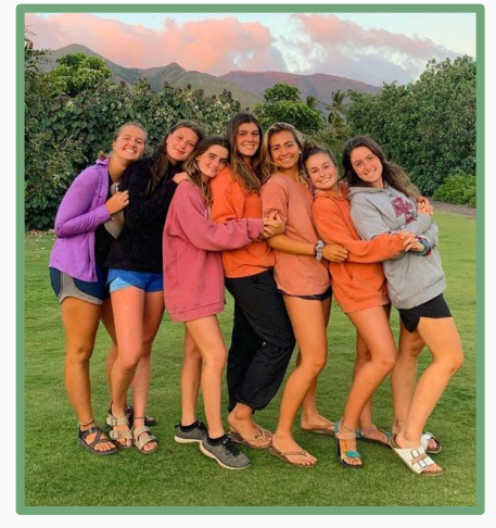
Group travel and service program in Hawaii.