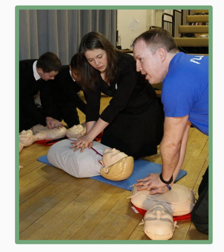
Studying to be an EMT.