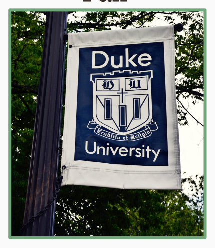
Off to Duke!