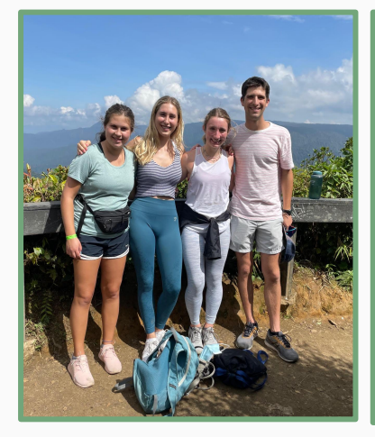
Spanish Immersion + Travel in Costa Rica.