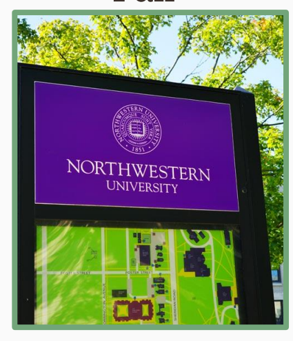
Off to Northwestern!