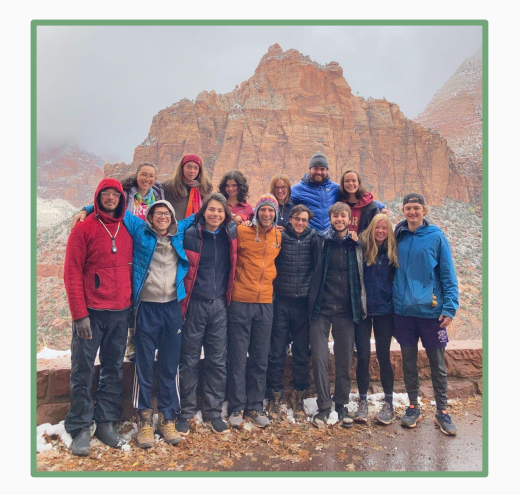
Wilderness + Conservation Program in the U.S.