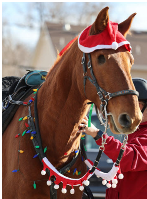
One example of dressing a horse for the occasion