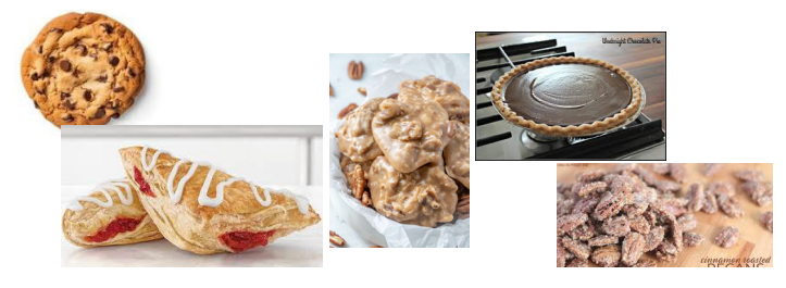
Yes, we had many desserts in the auction. These are only examples of some of them. It was a dessert lover's paradise.

On other tables were the desserts being auctioned, and another table held a selection of beverages from water to iced tea to lemonade, and others.