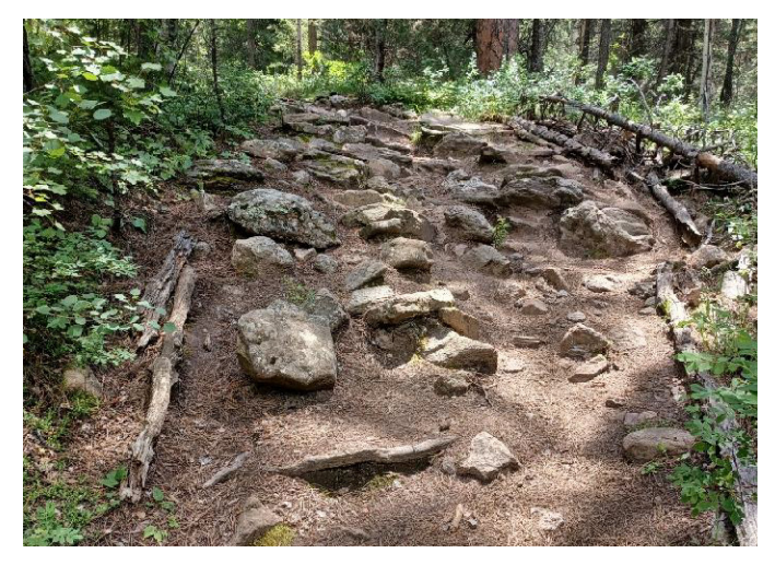
See all these rocks? We are going to reroute the trail around this rocky rise, to make this trail safe for all.

We need at least 10 volunteers for this trail stewardship day.