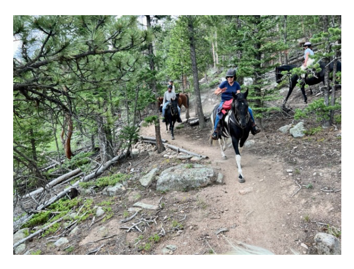
Yes, the Limber Pine trail in Hermit Park Open Space has lots of fun and beauty.