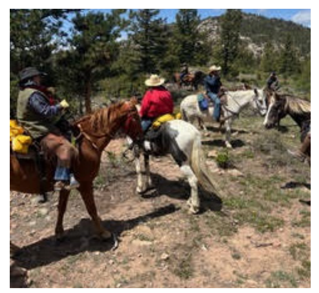
See "Sundance" on page 6

LCHA friends had a wonderful day riding at the Sundance Guest Ranch Memorial Day weekend ride.