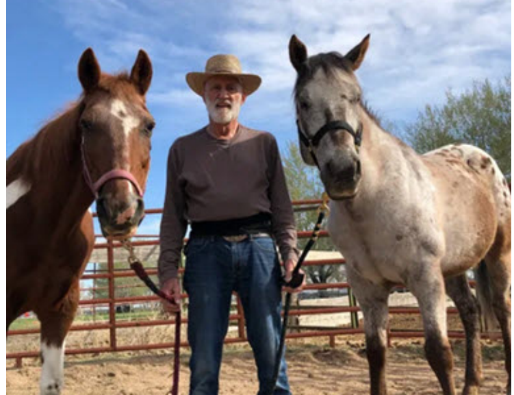
See "Part 2" on page 2