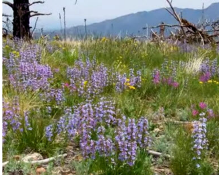
Some of the grasses and flowers have returned.