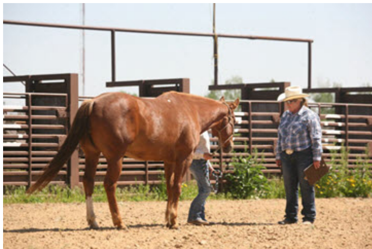
An inspection in process.

If you have lived in Colorado for years or for just a few days or months, a brand inspection could be a really good idea. Brand inspection of horses is mandatory.