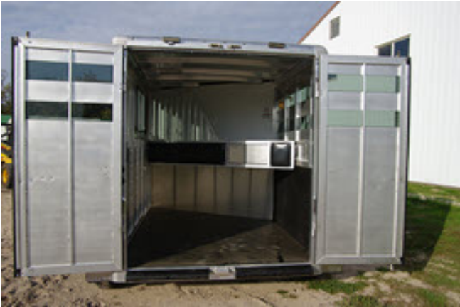
A step-up trailer. This image shows a divider inside.