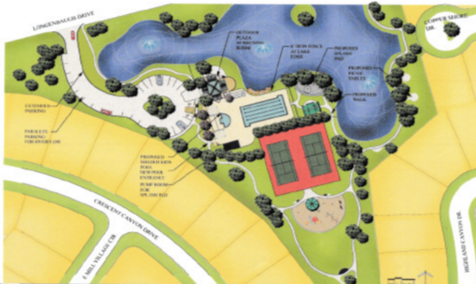
M.U.D. No. 173 COPPER LAKES RECREATION UPDATE