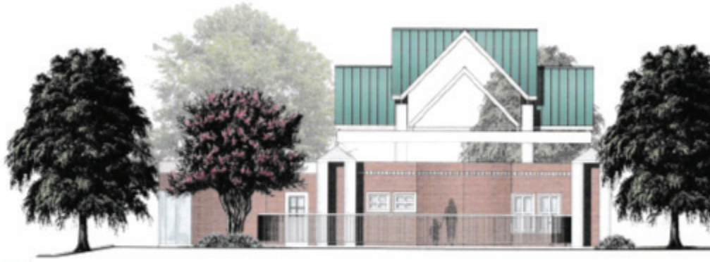
MUD 173 COPPERLAKES RECREATION CENTER PAVILLION REMODEL MEETING ROOM ELEVATION C