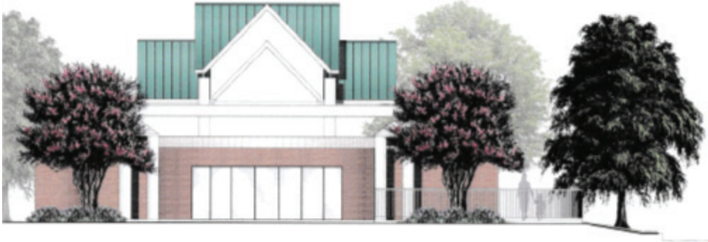
MUD 173 COPPERLAKES RECREATION CENTER PAVILLION REMODEL MEETING ROOM ELEVATION B