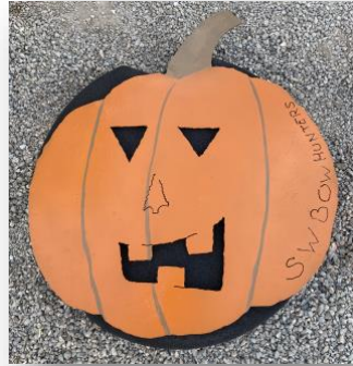
The Great Pumpkin