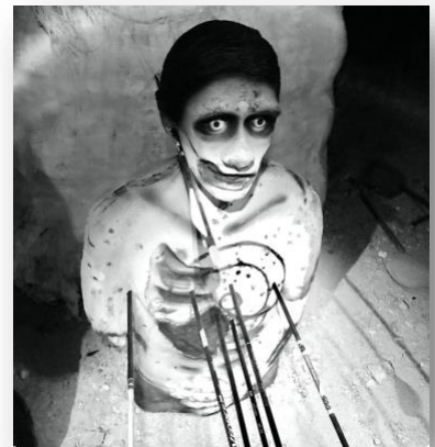
UnDead Fred gets his ear pierced.

On October 24 th SWBH held its first annual Haunted Canyon 3D Night Shoot on the Canyon Course at the Adair Park Archery Range. The course consisted of 20 3D targets, including a hanging bat, a Velociraptor, and UnDead Fred, just to name a few. The participants found out that shooting at night is a lot harder that shooting during daylight hours! There was also a 'smoker round' that featured the 1/4" steel-plated Great Pumpkin. Only the very