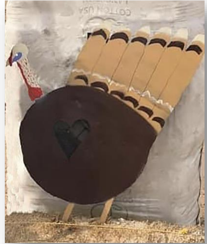
The rare and illusive "Gila River Swamp Gobbler"

On November 8 th , 23 participants competed for frozen turkeys in the 2 nd Annual Swamp Gobbler Turkey Shoot . Registration began at 7:30 a.m. and the shotgun start began at 9:00am. The shoot consisted of 28 3D targets, and for those who like to live dangerously, the rare and illusive "Gila River Swamp Gobbler" could earn you 20 points if you shot at it instead of the foam turkey target. First place winners in each category received a frozen turkey for their Thanksgiving feast!