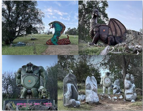
Supersized targets: Cobra, Dragon, Ogre, and Yeti.

On Saturday and Sunday, April 9 & 10, the annual Break the Barriers 3D Open was held in the foothills above Fresno, CA. Approximately 800 archers from all over the U. S., both professional and amateurs, participated this year. There were two courses with 51 targets each, and each of the two courses is between three and four miles in length and meander through the hills. This year, they had four super-sized, custom made targets, and shooting distances that ranged from 3 yards to 101 yards.