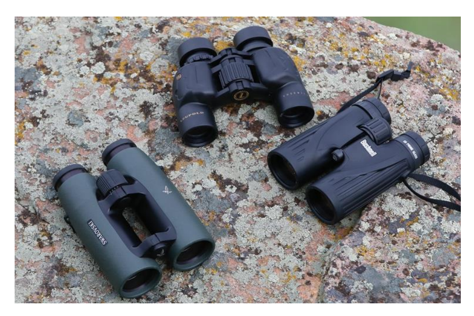
Binoculars vary wildly in price as well as sizes, but inevitably the old Porro prism (shown at top) can be built to top-quality optical standards, at half the price of top-quality roof prism units.

Roof prisms are stacked one atop the other, so fit into a more-compact barrel with no bend or offset required. This makes for a more compact and rugged package, the prism unlikely to get bumped out of collimation. The