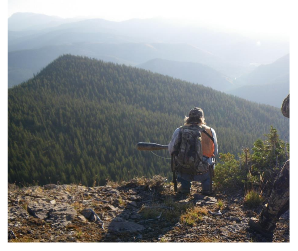
Elk hunting can take you to big country far from the truck. Better choose the right binocular for the work you'll be doing.

almost magical. Yes, 6X is more than powerful enough for picking eyes, ears, tines, noses, and legs out of forest clutter to 200 yards. Everything will look 6 times closer, so a whitetail at 100 yards will appear as if only 17 yards away. One at 200 yards will look like 34 yards.