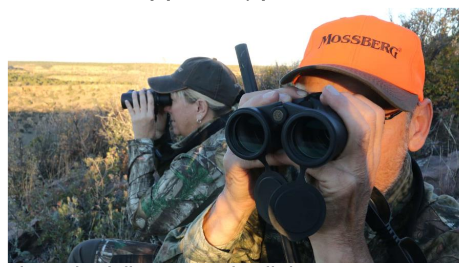
When your brand of hunting requires lots of looking to spot game, your binocular can be as essential as your ammo.

The other key to brightness is the power/objective relationship. A bigger objective lets more light in. A higher magnification lets less light out. You can see this as the exit pupil in each eyepiece, with the binocular held at