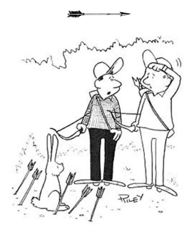
"Do you think it's my grip?"

To make it an authentic German dish, serve with fried potatoes and onions, potato salad, vegetables, red cabbage or coleslaw.