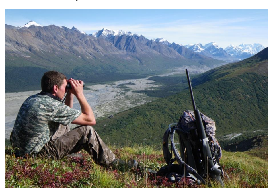
Binocular size often hinges on the kind of hunting you plan to do.

narrower the field of view. While you concentrate on that shadow behind that tree with your 12X, the world's record buck could walk out from behind another tree just outside your field of view. With the wider field of view in an 8X or 6X, you would have seen it.