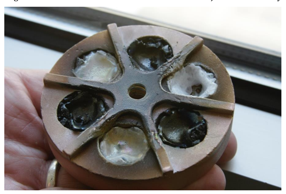
This disk of rare-earth anti-reflection minerals supplies the anti-reflection coatings applied via electronic vapor deposition.

Anti-reflection coatings don't just maximize brightness; they also minimize flare and glare. Because they reduce reflections, there is less light bouncing around inside the barrel. You see this uncontrolled, reflected light as an orange haze and flare when the sun strikes the objective lenses. By