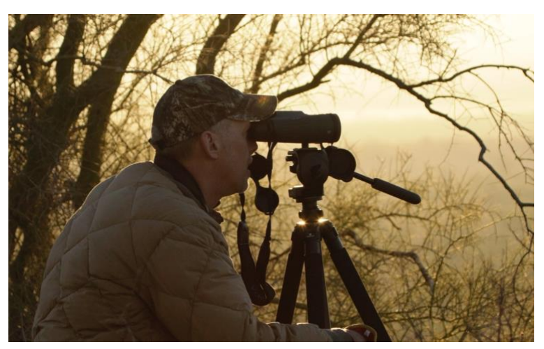
Serious glassing with high magnification requires solid support for the binocular.

High-magnification binoculars should include a threaded attachment point for aftermarket adapters, for securing to a tripod. A good warranty is worth