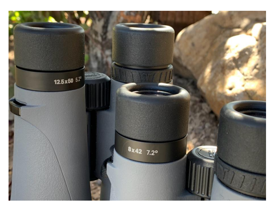
Increased magnification levels don't increase binocular size so much as increased objective lenses do. Eyepiece magnification can enlarge what the basic objective passes to them. Note the rubberized twist-up eye cups.

This exit pupil relationship suggests you buy a binocular with a 7mm exit pupil, the maximum dilation of your pupil at dark. But the resultant bulk and weight argue against this. Do you really want a 10x70mm binocular tugging at your neck all day in order to perhaps clearly see a buck a half hour after legal shooting light? Or even an 8x56mm? And you don't have to. In the real world, a top quality, fully multi-coated 8×42 binocular—or any power/objective combination that yields a 4mm to 5mm exit pupil—should clearly transmit