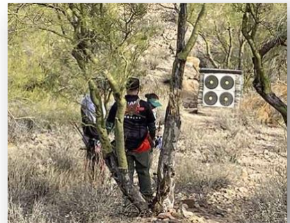
Participants enjoyed a beautiful and a challenging course.

The Weekend of November 16 th and 17 th proved to be quite successful for SWBH archers at the 2024 Arizona State Field Championships, held in Oro Valley, near Tucson.